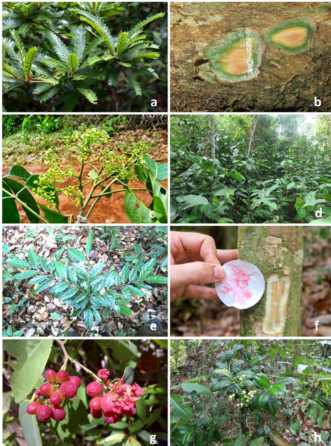
Fig. 3 Nickel hyperaccumulator plants in South and Southeast Asia: a Phyllanthus balgooyi (Phyllanthaceae) in Sabah, Malaysia is a small understorey tree. b Phloem sap exuding from Phyllanthus balgooyi contains up to 20 wt% Ni. c Knema matanensis (Myristicaceae) in Sulawesi, Indonesia; d Rinorea bengalensis (Violaceae) can be locally dominant in lowland forest, in Sabah, Malaysia. e Dichapetalum gelonioides subsp. tuberculatum (Dichapetalaceae) from Mount Silam, Malaysia. f Main stem of Dichapetalum gelonioides subsp. tuberculatum showing its Ni-rich phloem tissue with colorimetric response in dimethylglyoxime test-paper. g Sarcotheca celebica (Oxalidaceae) from Sulawesi, Indonesia. h Psychotria sarmentosa (Rubiaceae) is the only known Ni hyperaccumulator in South and Southeast Asia that is a climber