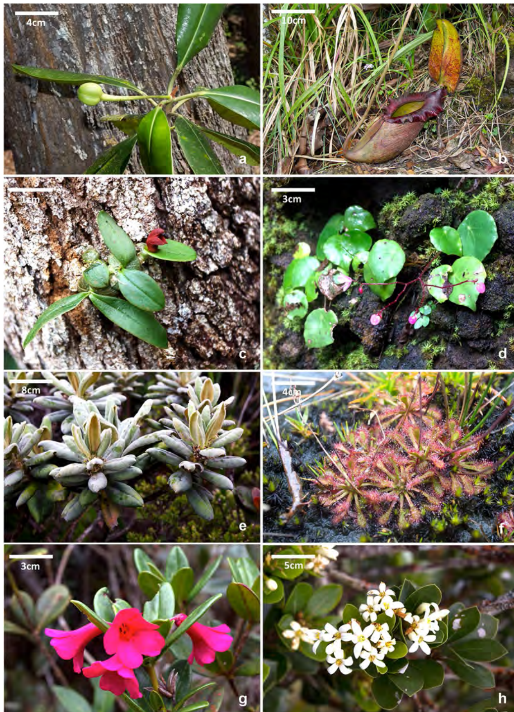
Fig. 4 Ultramafic edaphic endemics from South and Southeast Asia: a The monotypic tree Borneodendron aenigmaticum (Euphorbiaceae) is endemic to Sabah (Malaysia) on ultramafic soils in the lowlands. b The world's largest carnivorous pitcher plant, Nepenthes rajah (Nepenthaceae) is endemic to Kinabalu Park in Sabah where it occurs in the montane zone. c The epiphytic or lithophytic orchid Porpax borneensis (Orchidaceae) is restricted to ultramafic outcrops in Sabah, Malaysia. d The recently described Begonia moneta (Begoniaceae) occurs lithophytically in lowland ultramafic forest in Sabah, Malaysia. e Scaevola verticillata (Goodeniaceae) is endemic to the summit of the ultramafic Mount Tambukon in Sabah, Malaysia. f The carnivorous Drosera ultramafica (Droseraceae) is endemic to a limited number of mountainous ultramafic outcrops in Malaysia and the Philippines. g Rhododendron baconii (Ericaceae) is another hyper-endemic restricted to Kinabalu Park, Sabah, Malaysia. h The specific epithet of Pittosporum peridoticola (Pittosporaceae) indicates its habitat is on ultramafic soils in Sabah, Malaysia (all images are by A. van der Ent)