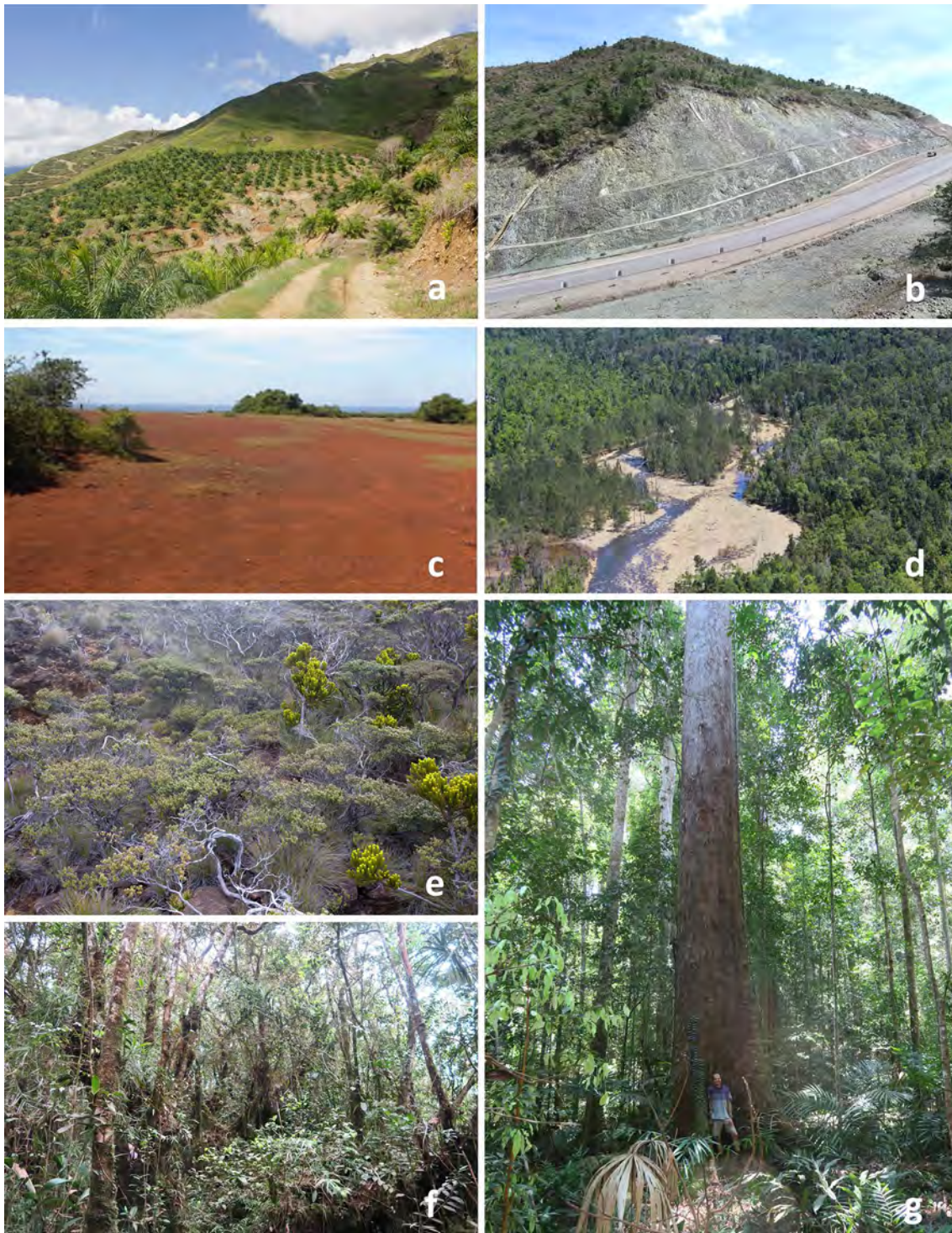
Fig. 2 Ultramafic outcrops and vegetation in South and Southeast Asia: a Oil palm estate in Sabah, Malaysia on eroding ultramafic soils. b Road cut through strongly serpentinised bedrock in Sabah, Malaysia. c Bare red Ferralsols at Ussangoda in Sri Lanka. d River flowing through an ultramafic outcrop in Halmahera, Indonesia. e Extremely stunted sub-alpine vegetation on ultramafic soils in Kinabalu park, Malaysia. f Montane cloud forest on ultramafic soils on Mount Silam, Malaysia. g Exceptionally tall lowland mixed dipterocarp forest on ultramafic soils in Sabah, Malaysia